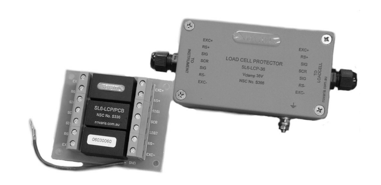
Figure 1: Novaris load cell protectors