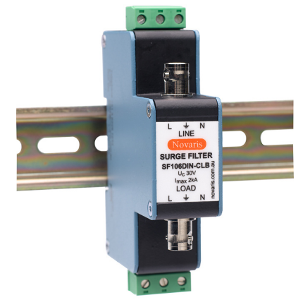
Figure 1: SFD1-6-2-30-C

1.2 The Novaris combined power and signal protectors are engineered to combine a Novaris Dinsafe surge filter, with a Novaris coaxial CCTV protector in one convenient unit. This makes them ideal for protecting both the power and signal lines of a CCTV camera system.